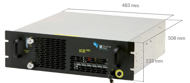
19" rack option

VISIBLE AND INVISIBLE LASER RADIATION AVOID EYE OR SKIN TO DIRECT OR SCATTERED RADIATION. CLASS 4 LASER RADIATION PRODUCT Max. Average Power : 20 W Max. Energy/pulse : 2J Pulse duration : <20ns Emitted Wavelength : 190/400nm